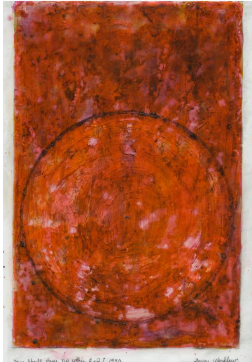
"Thou Shall Have No Other Gods"